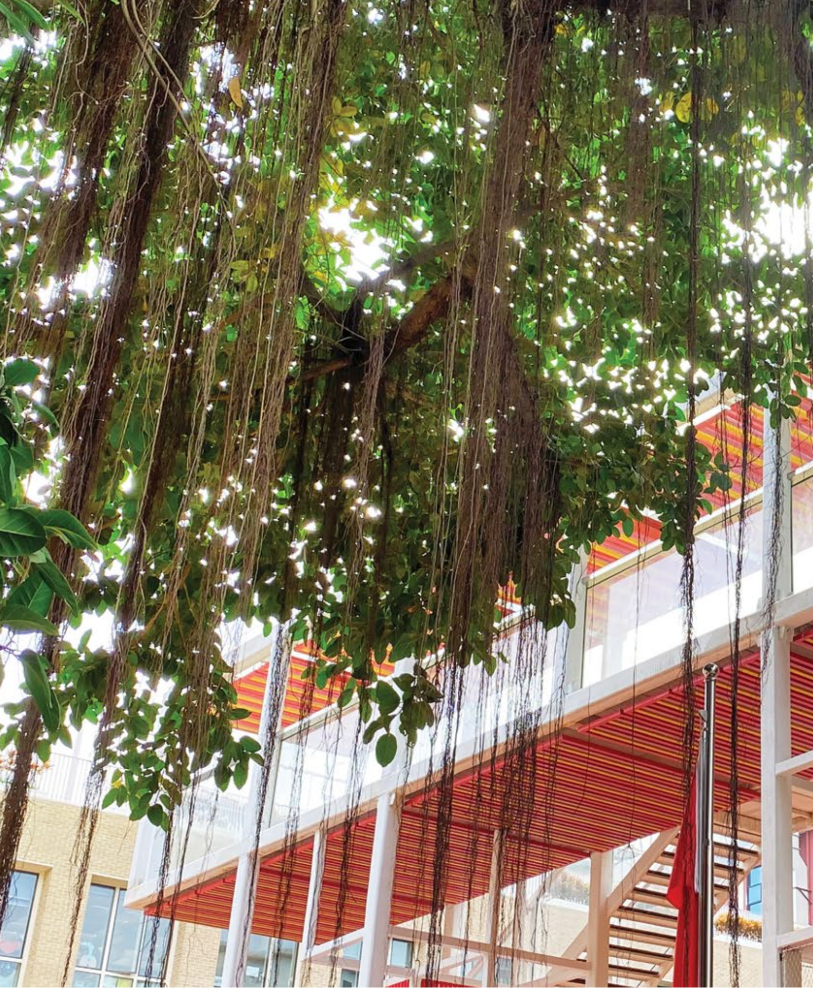
See page 126 for Efficiency Lab for Architecture's Avenues Early Learning Center in Shenzhen, China.