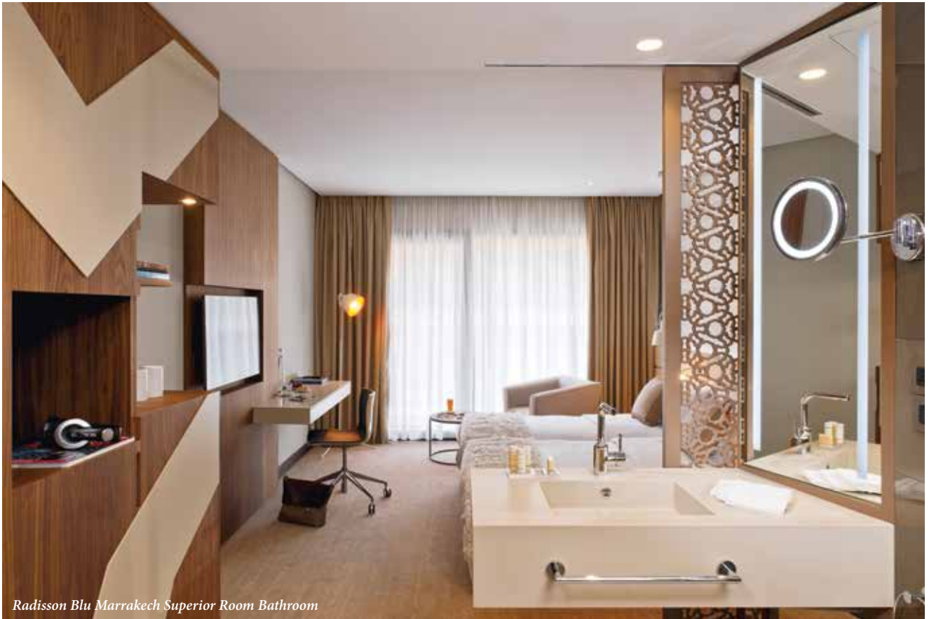
Radisson Blu Marrakech Superior Room Bathroom