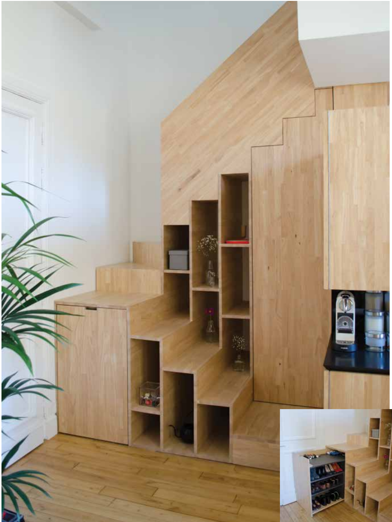
Staircase and Storage