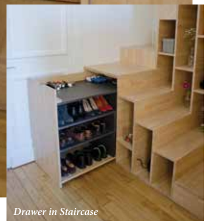
Drawer in Staircase