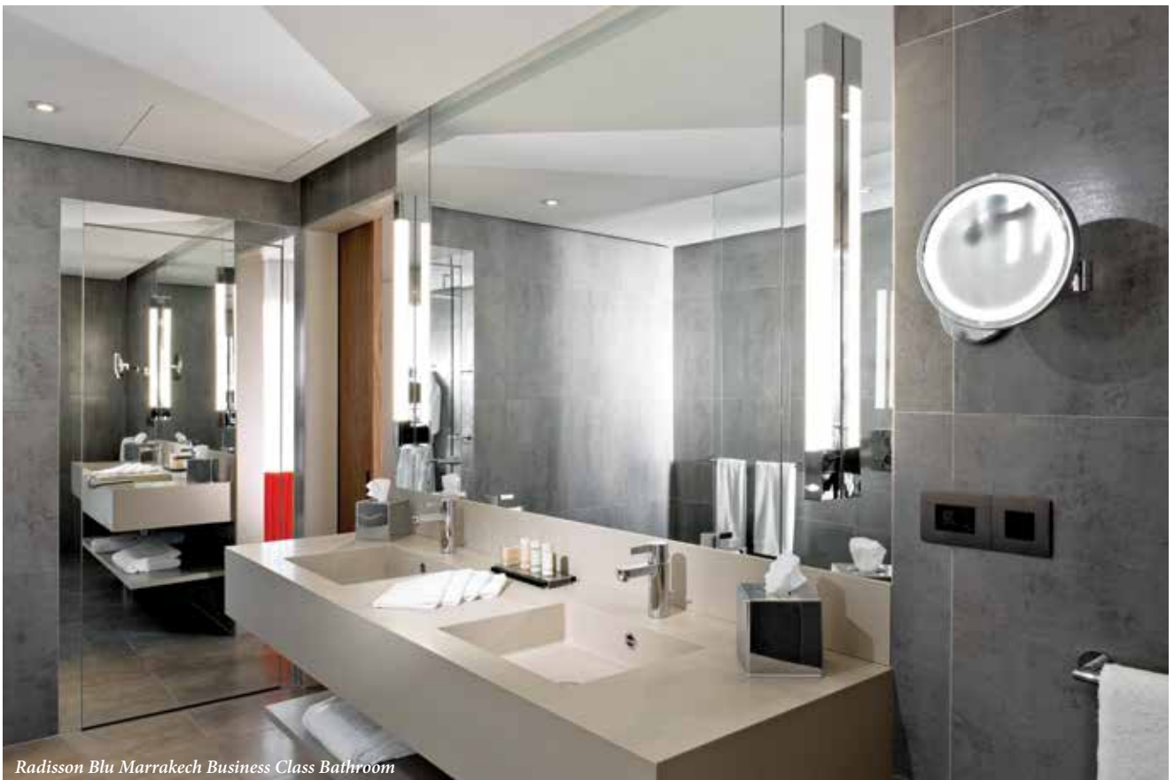
Radisson Blu Marrakech Business Class Bathroom