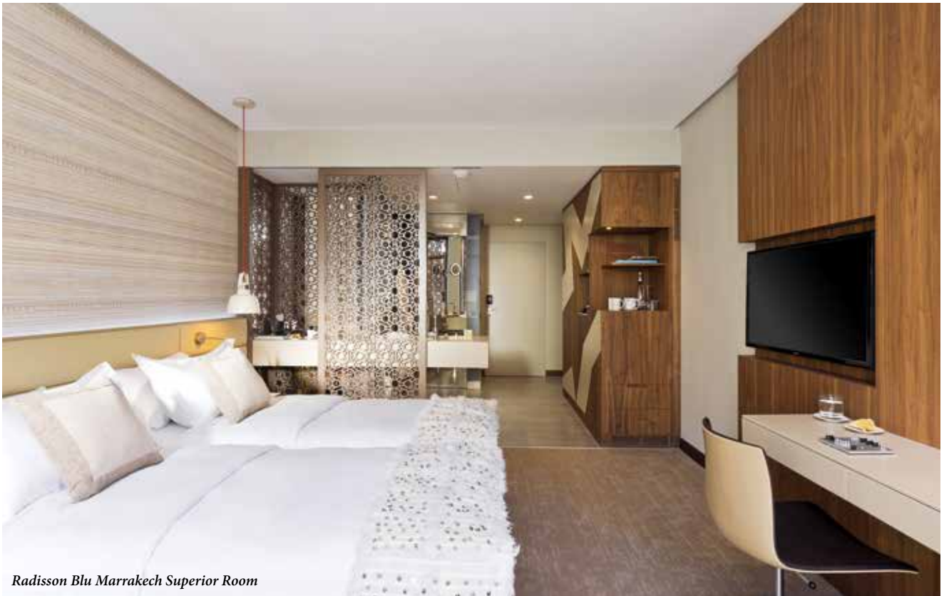
Radisson Blu Marrakech Superior Room

Operated by the Carlson Rezidor hotel chain