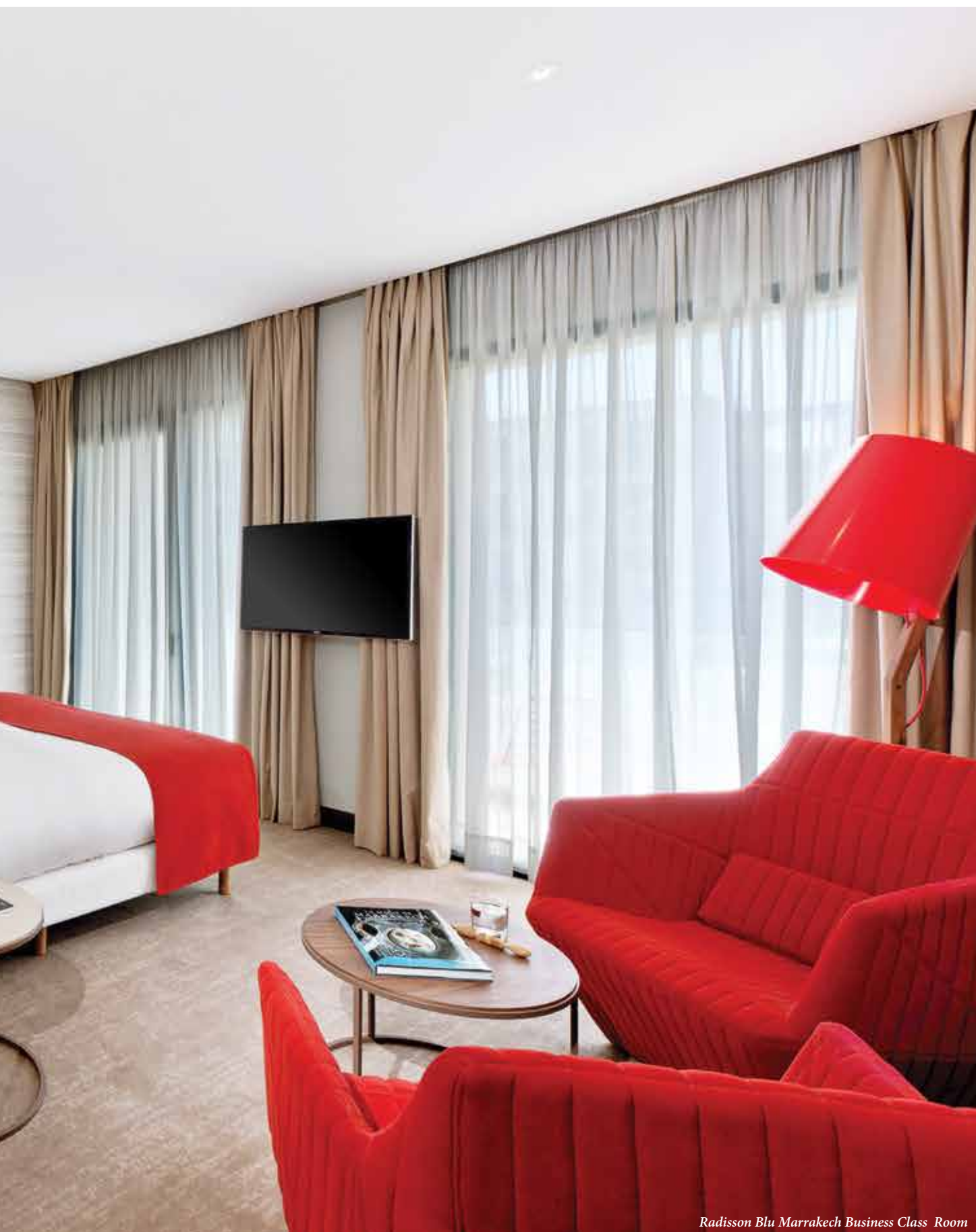
Radisson Blu Marrakech Business Class Room